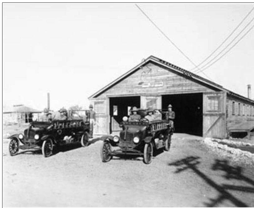
QMC Ford-Buckeye 250 gpm pumpers at Fire Station No. 3

Along with the motor fire apparatus there are located around the different zones thirty-six hose reels, fully equipped, which can be laid into ten lines, each of which will have in the event of fire at night the men can clothe themselves and be ready to leave the house within fifteen minutes.