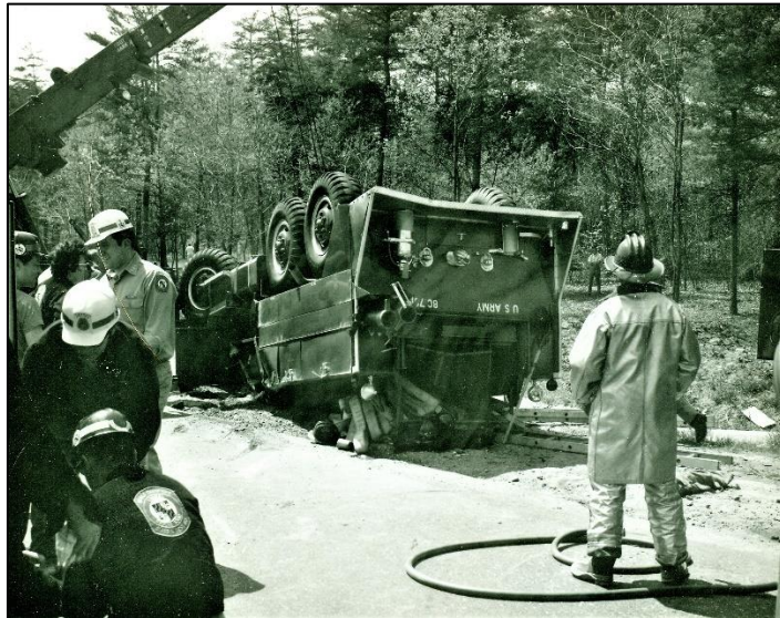
1966 Kaiser-Fire Master Class 530B USA 8C7815.