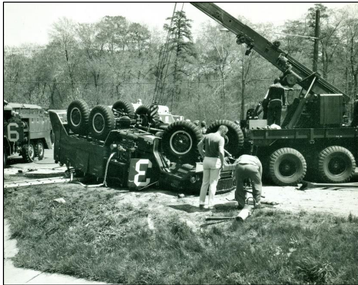
Army crane prepares to upright the truck.

On 28 April 1968 Fort Meade's Engine 3 overturned at Rockenbach Road and Cooper Ave. Engine 3, an Army Class 530B. USA 8C7815, 1966 Kaiser-Fire Master was assigned to Fire Station No. 3 at Chamberlain Ave. and 13 th St., and was staffed with military fire fighters who were part of the Army's Project Transition. The project allowed military personnel who were within 6 months of discharge a chance to train or revisit career fields as they return to civilian life. Within weeks of the accident the fire station was closed and the remaining Army personnel were assigned to Fire Station No. 2 at Tipton Army Airfield to complete their training.