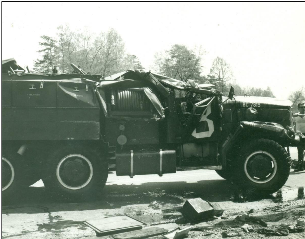
Right side view.