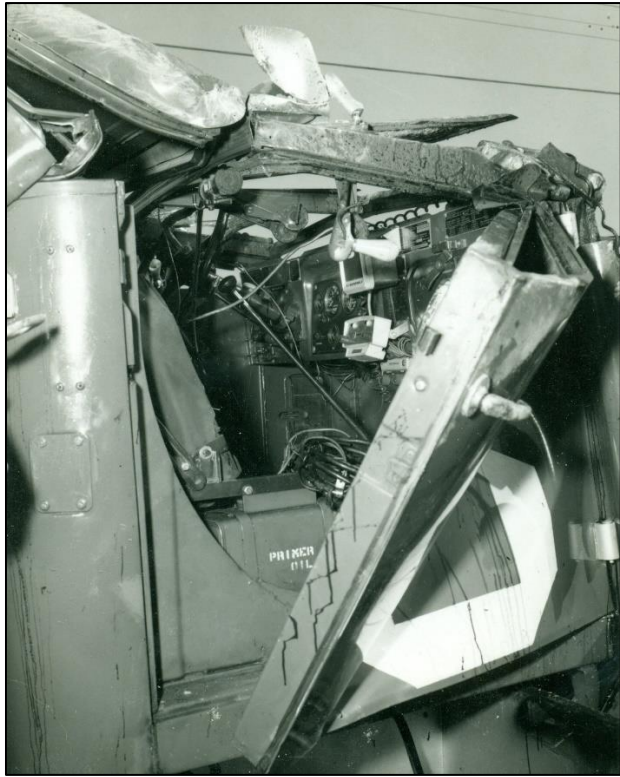
Right Side Cab.