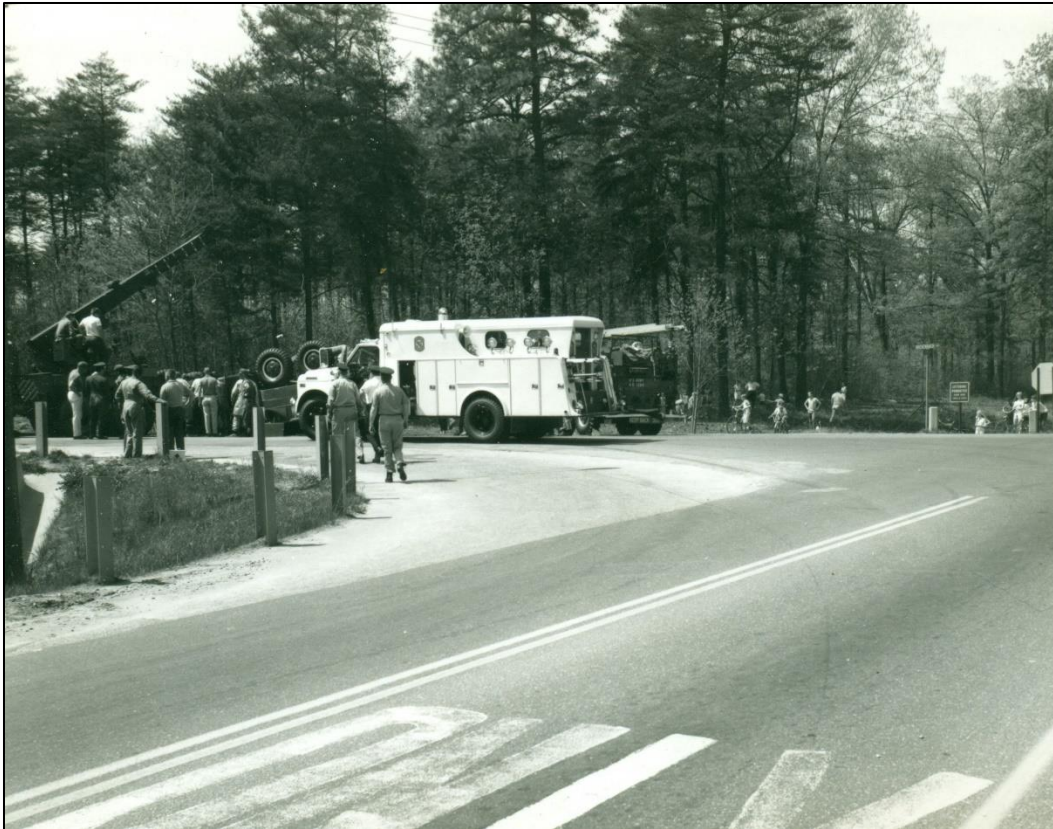
Laurel rescue squad and FM Engine 6, 530B 8D1284, 1962 Reo-Fire Master.