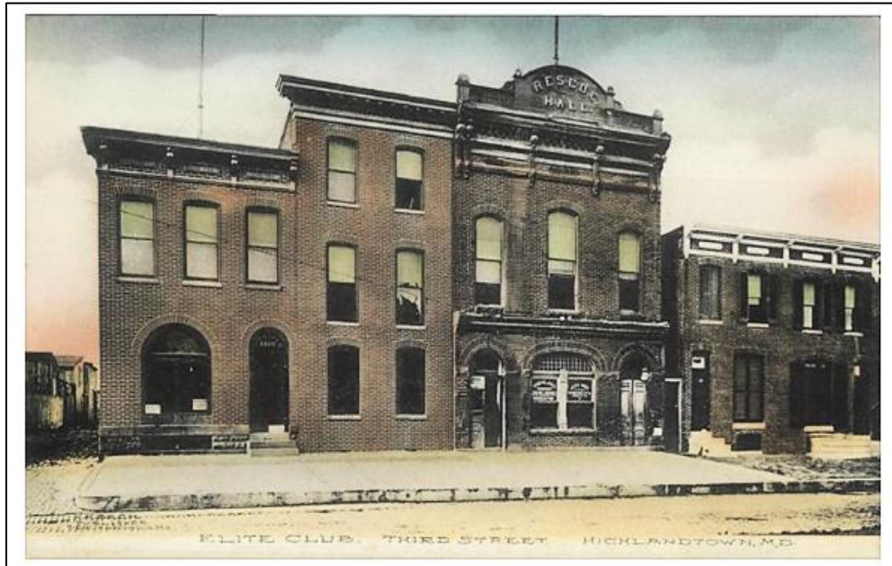
Former quarters of the Rescue Hook & Ladder Company