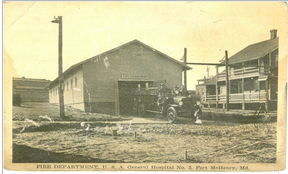
Fort McHenry Hospital Fire Station, 1918 Brockway-LaFrance

From 1917 until 1923, Fort McHenry was the site of U.S. Army General Hospital No. 2, which provided medical facilities for the troops returning from World War I. It was the largest military hospital in the United States with 3,000 beds and over 130 temporary buildings constructed outside the walls of the star shaped fort.